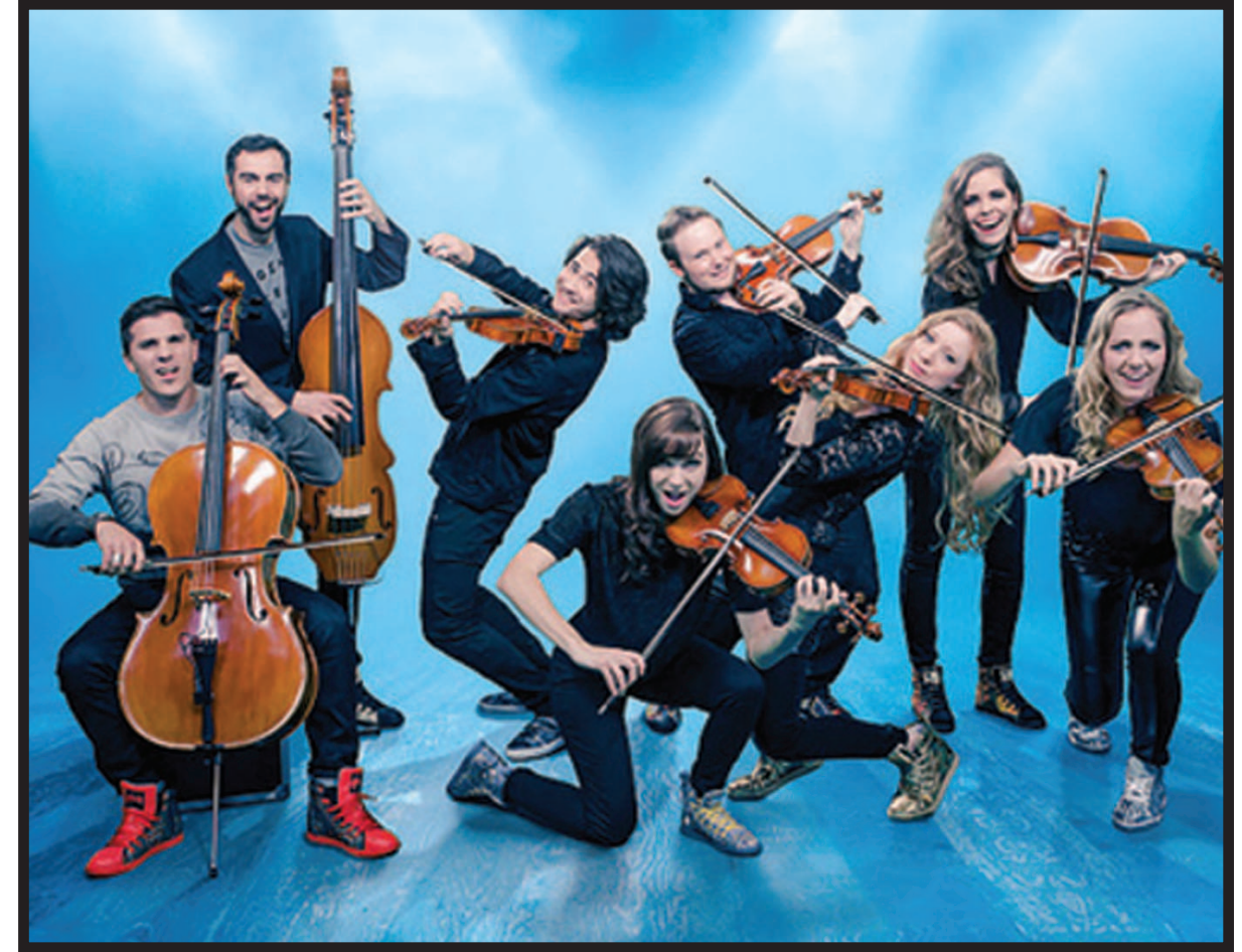
HIGH-ENERGY STRING BAND 'BARRAGE 8' WILL PERFORM APRIL 26

Artist profiles, show times, links to video clips, and more are available at www.SEA coastEA.org.