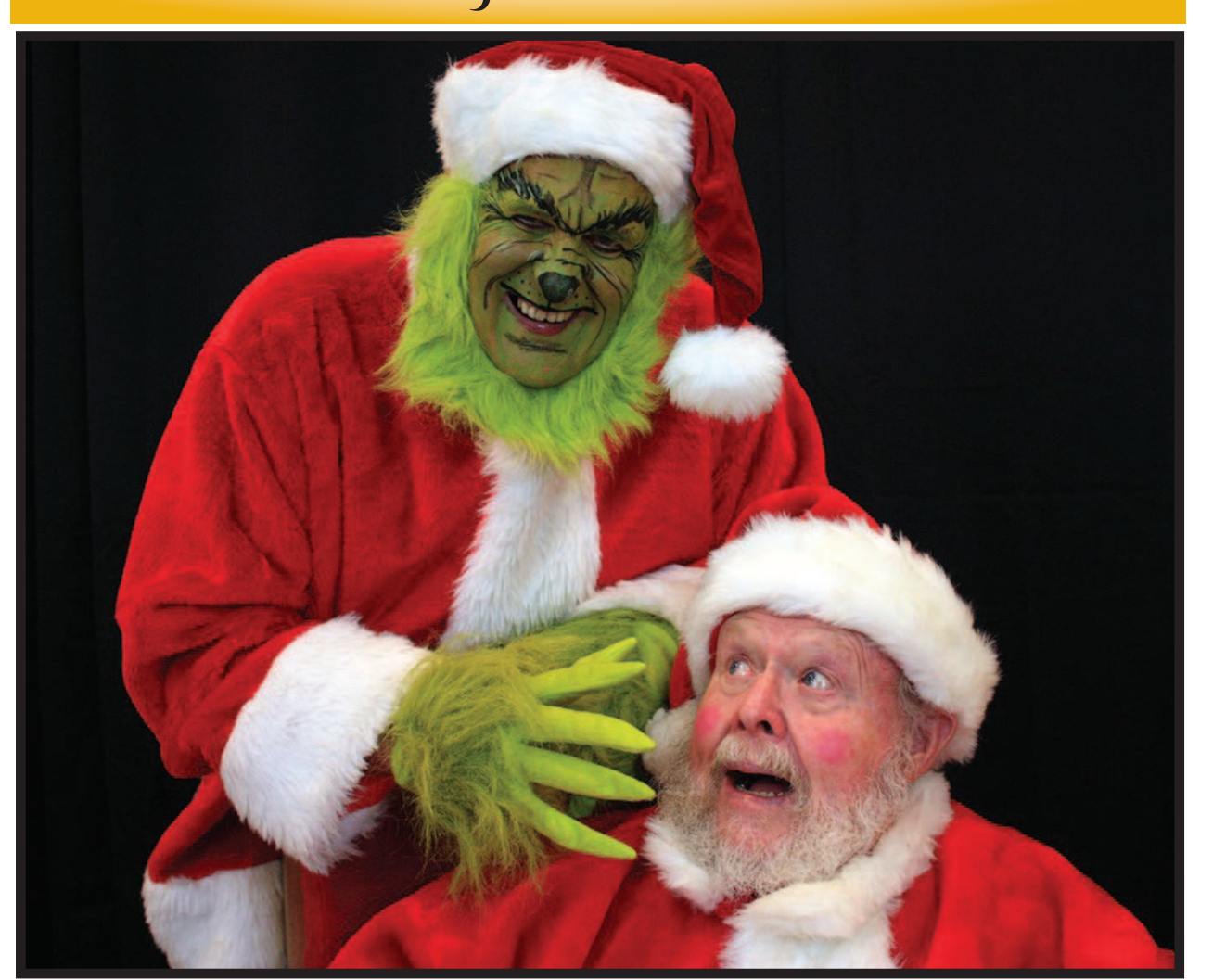
HO-HO... UH OH! THOUGH DETAILS ON SANTA'S ABDUCTION BY THE GRINCH ARE SKETCHY, ALL WILL BE REVEALED AT THIS YEAR'S HOLLY JOLLY FOLLIES, PRESENTED BY CROW. THE POPULAR COMMUNITY HOLIDAY SHOW WILL TAKE PLACE FRIDAY, DEC 2, AT 7 P.M.; SATURDAY, DEC 3, AT 2 AND 7 P.M., AND SUNDAY, DEC. 4, AT 2 P.M. AT THE FEC.