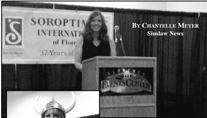
BY CHANTELLE MEYER Siuslaw News

Women organizations raise more than $20,000 in two events at Florence Events Center