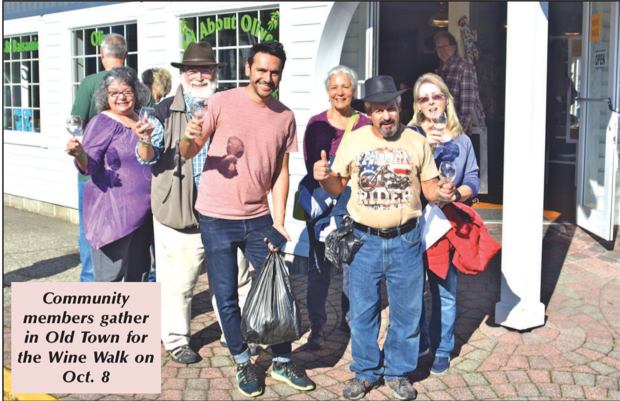
Community members gather in Old Town for the Wine Walk on Oct. 8