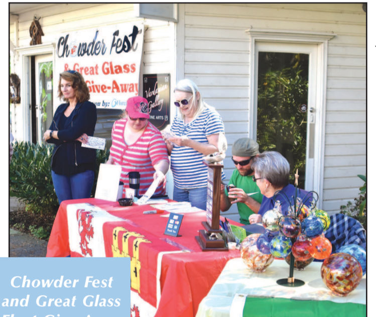
Chowder Fest and Great Glass Float Give-Away Oct. 9