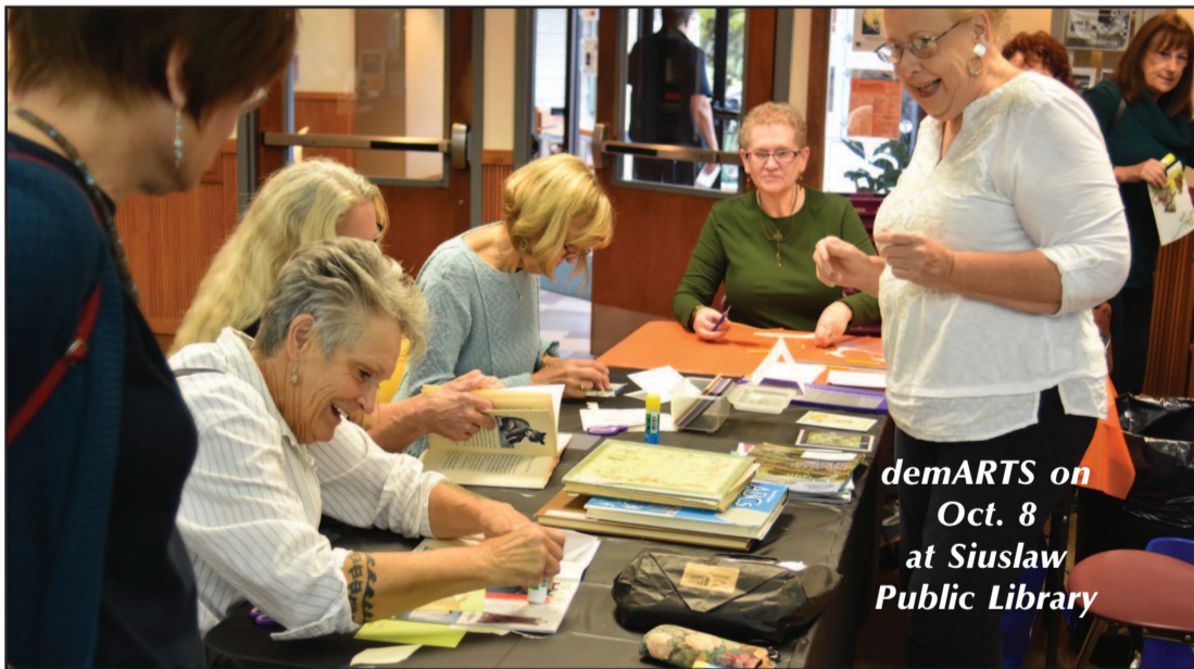
demARTS on Oct. 8 at Siuslaw Public Library