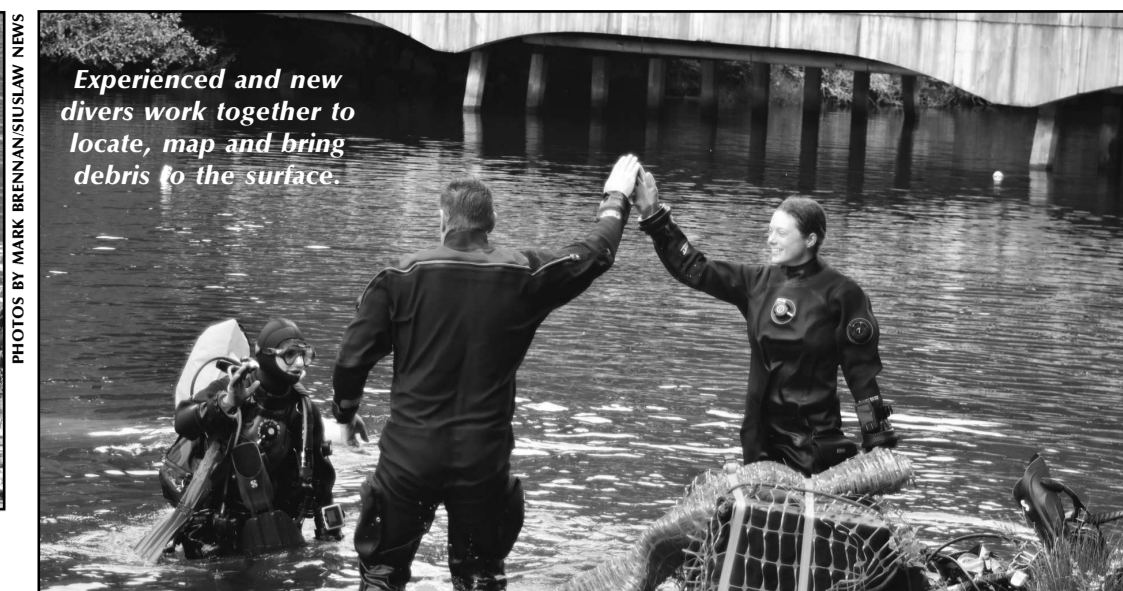
Experienced and new divers work together to locate, map and bring debris to the surface.