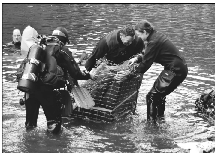
For more information on Skin Divers Supply at 541-Project Aware, call Eugene 342-2351.