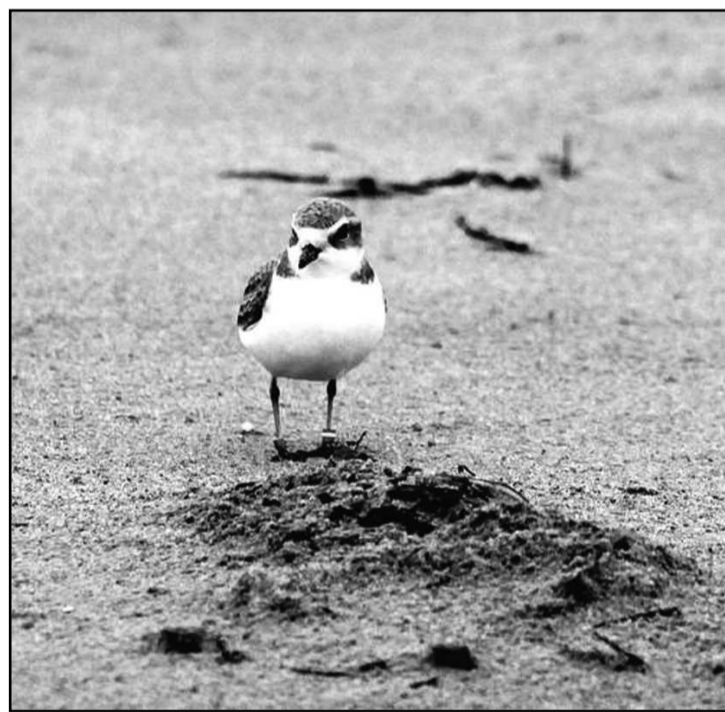
Western Snowy Plover

"Discover the plight of the plover and the efforts that have been invested for more than 20 years to stabilize the population and recover this marvelous little bird."