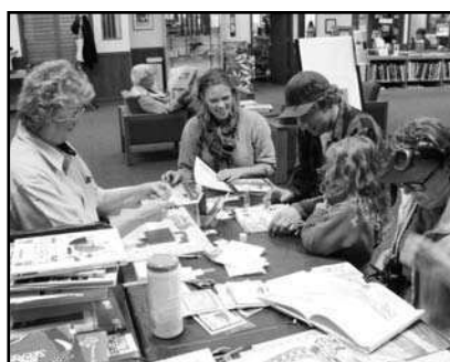
Area artists and community members create art at Siuslaw Public Library during last year's demARTS event.

Fans of the performing arts will be treated to a preview of the "Pirates of Penzance" by the Last Resort Players at 1