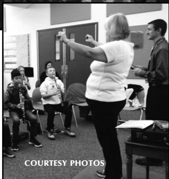
first concert on Monday, Dec. 5, at the middle school.