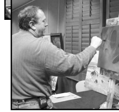
Area artists and community members create art at Siuslaw Public Library during last year's demARTS event.