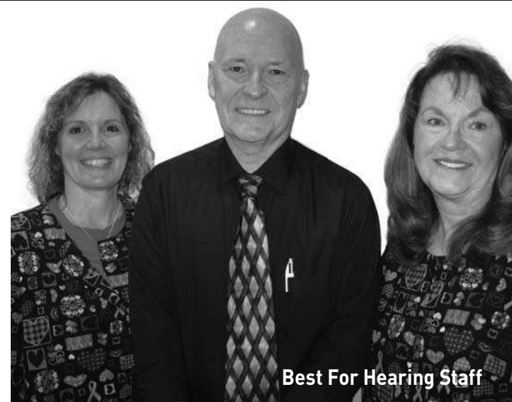
Best For Hearing Staff