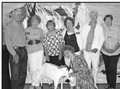
FEC thanked its more than 50 volunteers at a special "Favorite Things" lunch on Aug. 17.