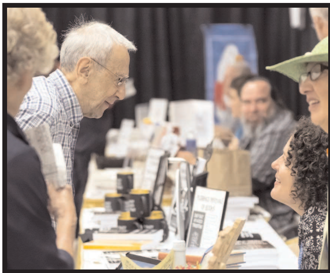
READERS AND AUTHORS HAVE THE OPPORTUNITY TO MEET FACE-TO-FACE.