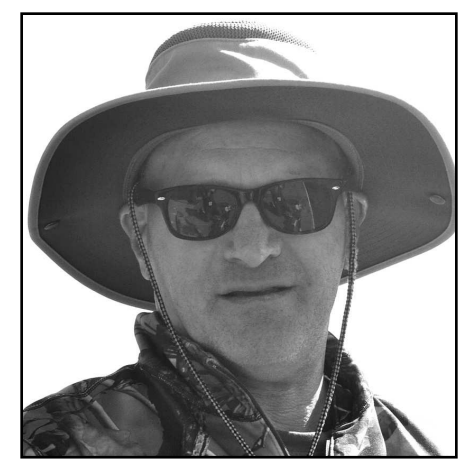
"Just getting out on the water in my kayak and catching enough fish to can and smoke for the whole year."