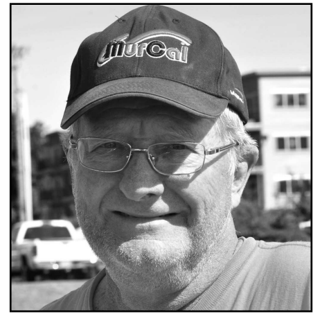
"The weather is so nice in the fall. It's the best time of year to go fishing. I've got family that comes up for it and we all look forward to it each year.'

What is your favorite thing about the fall fishing season?