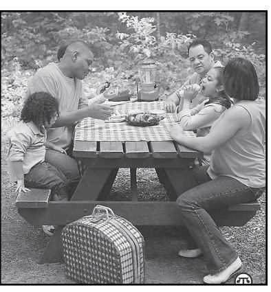
A few simple steps can help you avoid mosquito bites and the diseases they may

• Eliminate mosquito-breeding areas. Female mosquitoes can lay thousands of eggs just about anywhere standing water collects. Those eggs become mosquito larvae and then adult mosquitoes in 10 to 14 days. To combat mosquito breeding, conduct a site survey of your property every week in search of standing water. Make sure your