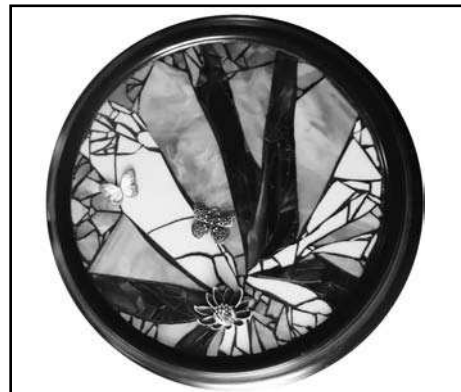
Stained glass art by Susan Stevens

The subject matters are from coastal scenes to electric storms over the ocean, from palm trees to majestic mountains,