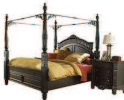
Bedroom Sets & Mattresses