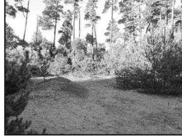
87977 Kelsie Way – Desirable Heceta South location, almost 1 acre lot with septic and water already installed. Partially cleared and ready for home plans. Only a few lots left in Heceta South. $85,000. #2533-15067114