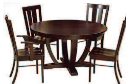
Dining Room Sets

Our Showrooms are full! New furniture weekly! Free Delivery!