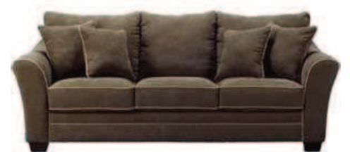
Couches & Sectionals Special Orders Accepted

Our Showrooms are full! New furniture weekly! Free Delivery!