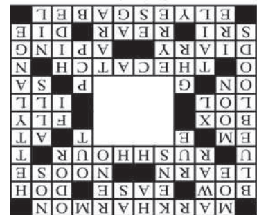
Eric Stonestreet Solution