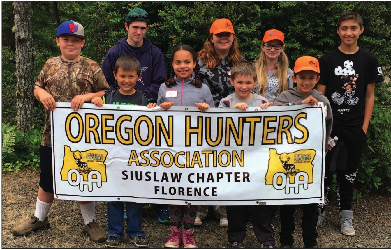
Participants in the first Oregon Hunters Association Youth Day event

The event was also made successful with the help of volunteers, who gave their time to assist with the educational event.