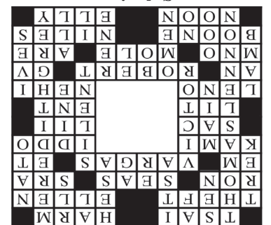
Billy Gardell Solution