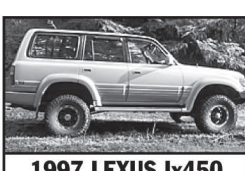
1997 LEXUS LX450 147k miles, 4x4, factory lockers, lifted, winch bumper, same running gear as Toyota landcruiser, lots of maint. done. $14,500 541-991-6604