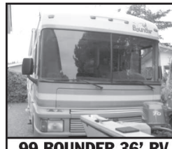
99 BOUNDER 36' RV Large slide, new roof, washer-dryer, jacks, air, camera. V-10 Ford. Clean. Under 37,000mi. $18,000 541-999-1477