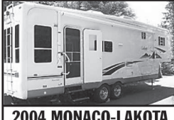
2004 MONACO-LAKOTA 32ft. 5th Wheel, alum. frame, NS, fiberglass ext.-GC, oak cabs, beige-int, 2-slides, queen, Mint condition. $26,900 541-997-9637