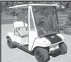
RARE GAS CLUB CAR Excellent, new tires & battery. Nice take a look. $1,500 541-999-1233