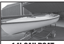
14' SAILBOAT With trailer, good condition. $899 obo 541-991-7916