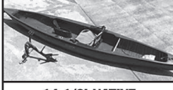
14 1/2' NATIVE WATERCRAFT ULTIMATE Prop drive, paddle or peddle. Great for fishing. Will deliver within 50mi. $975 obo 541-902-2202