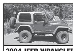
2004 JEEP WRANGLER 4X4, Good shape, auto, hard top removable, spare tire. CC Accepted $13,999 541-725-0061