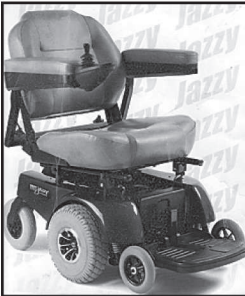
JAZZY MOTORIZED CHAIR $350 • 541-902-9195