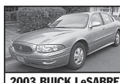
2003 BUICK LeSABRE Exc. cond., Power everything - all work. Includes Set of stud-ded custom snow tires, like new. $4,000 541-999-1444 541-991-7794