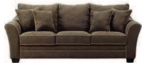
Couches & Sectionals Special Orders Accepted

Our Showrooms are full! New furniture weekly! Free Delivery!