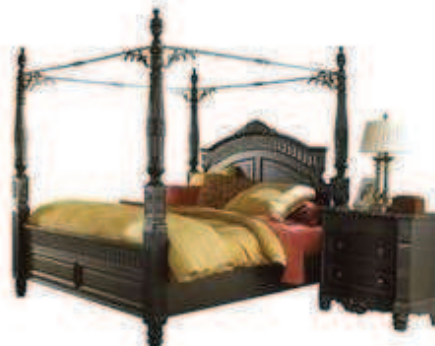
Bedroom Sets & Mattresses