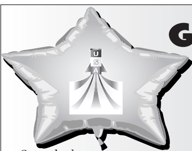
Saturday's Graphic Fireworks Safety Month

Here is how it works... We will put a graphic or photo in the box to the left. You find it somewhere in the classifieds. Come into our office, Enter your name, phone number and describe where you found the graphic or bring in a clipping to attach to your entry into the drawing for a gift certificate.