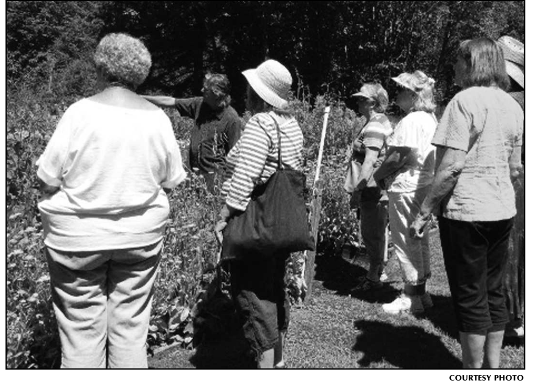
Herbalists take a tour of Thyme Garden in Alsea. They will go again July 21.

The main courses include a choice of fresh salmon baked