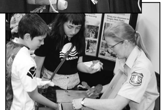
GREEN FAIR