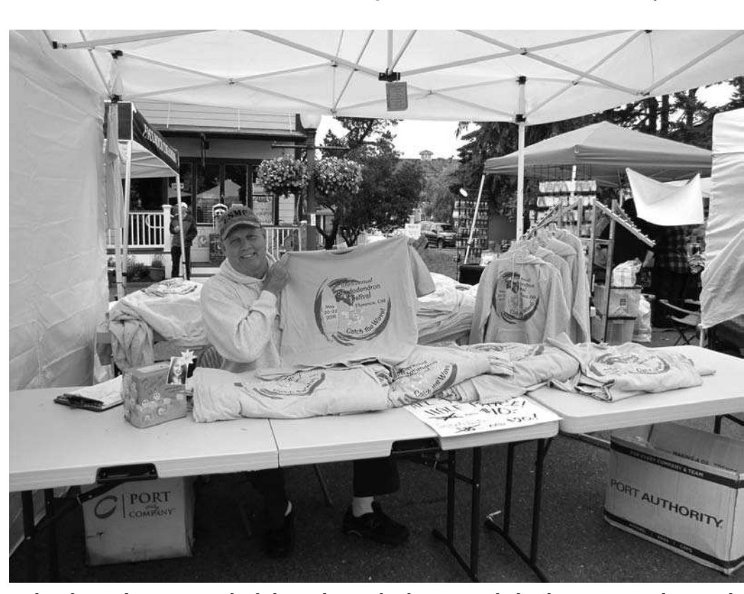
Chamber volunteers worked throughout Rhody Days to help Florence's 109th annual Rhododendron Festival go smoothly