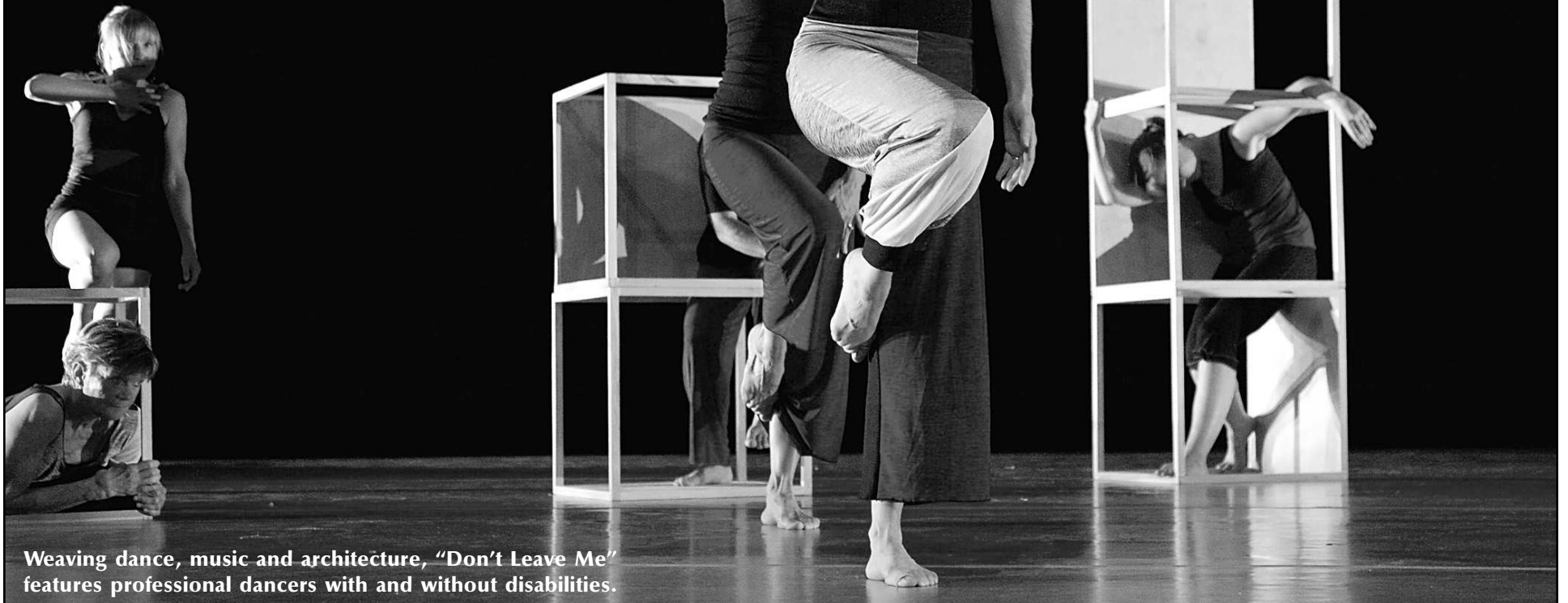
Weaving dance, music and architecture, "Don't Leave Me" features professional dancers with and without disabilities.