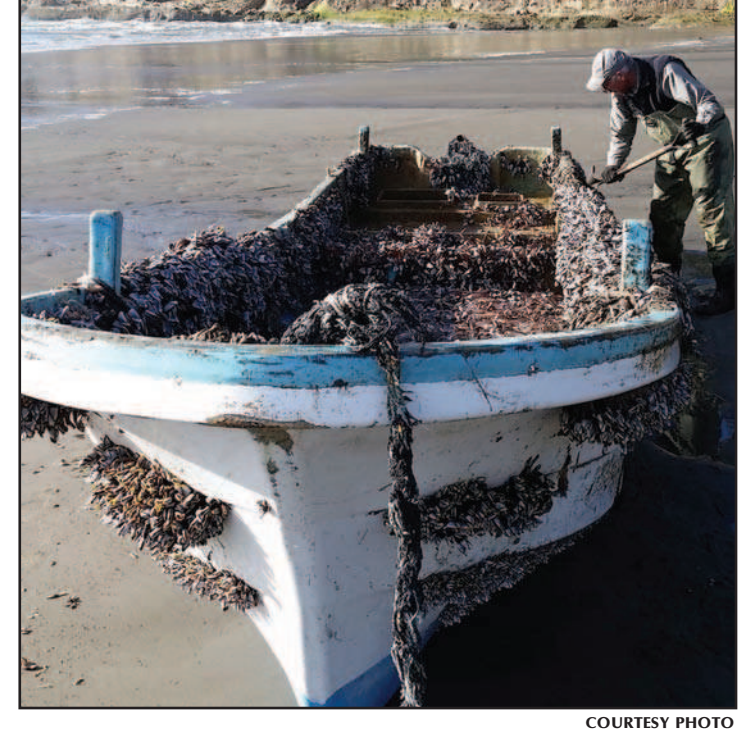
Tsunamni debris like this small boat can habor invasive species in breaches and barnicles.

Tsunami debris, but especially large pieces with cavities which could provide protected temporary habitat, pose threats