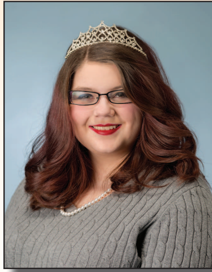
Hanna Anderson Junior SHS Sponsored by: Berkshire Hathaway Home Services Northwest Real Estate