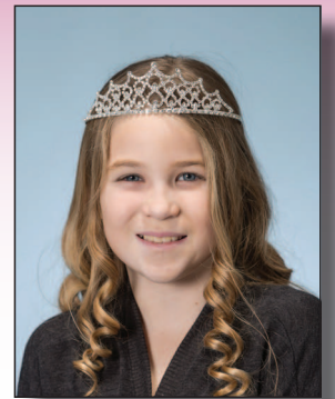
Sunshine Armer Sponsored by: The Siuslaw News