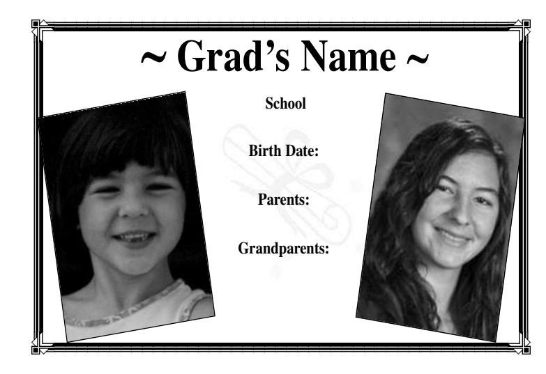
Coming Saturday, June 4th