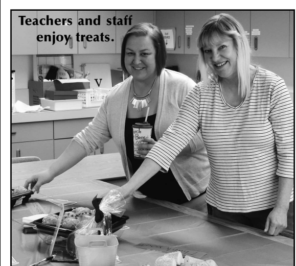
Teachers and staff enjoy treats.