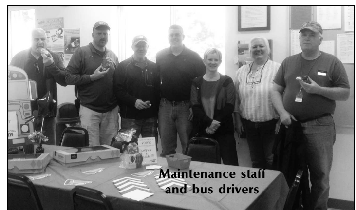
Maintenance staff and bus drivers