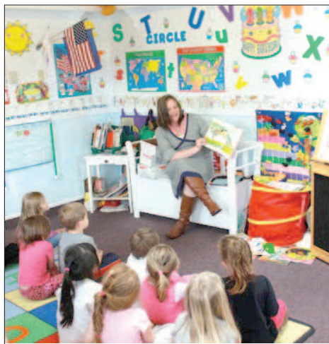
Read with a Rotarian