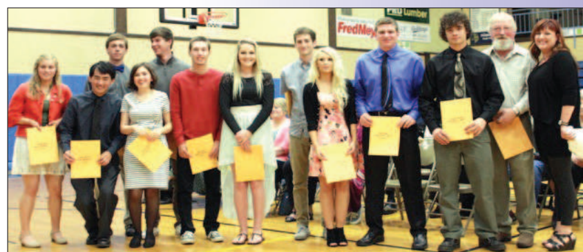
2015 Rotary Scholarships