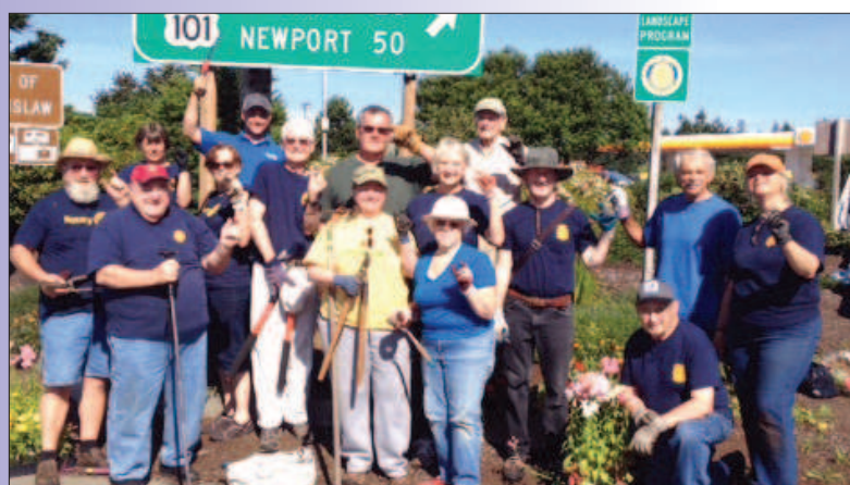
Power of Florence