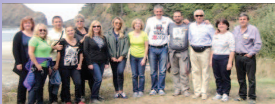
Friendship Exchange with the Romanians and Moldovans