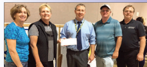
School Supply donation