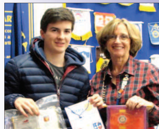
Foreign Exchange program