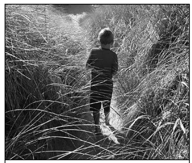
THE DUNES: Miles and miles of Dunes Recreation Area with the ocean as a backdrop. Trucks, ATV's and all types of sand enthusiasts...