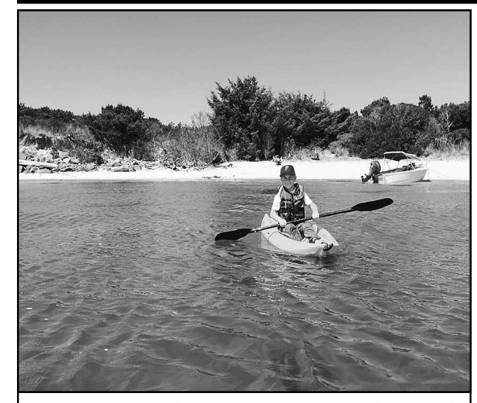
<u>THE WATERS:</u> Lakes, rivers & ocean. Fishing, crabbing, kayaking and more, Florence is a wonderland of waters...