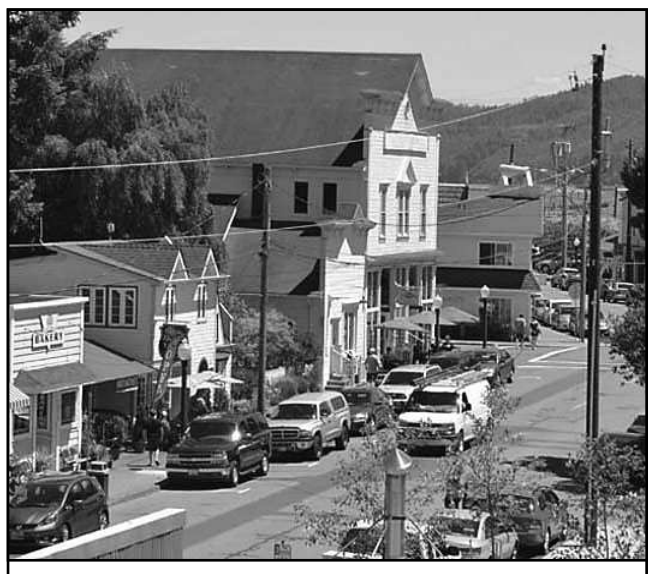
<u>OLD TOWN:</u> A leisurely stroll among quaint shops & restaurants. The river overlook and great coffee!