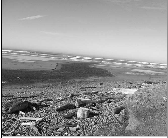
THE BEACH: It doesn't get any better than this beach - Winter, summer or any season.