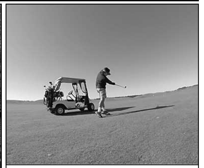
<u>GOLF:</u> Two great golf courses, Ocean Dunes & Sandpines. Links style of wide open fairways, choose you pleasure...