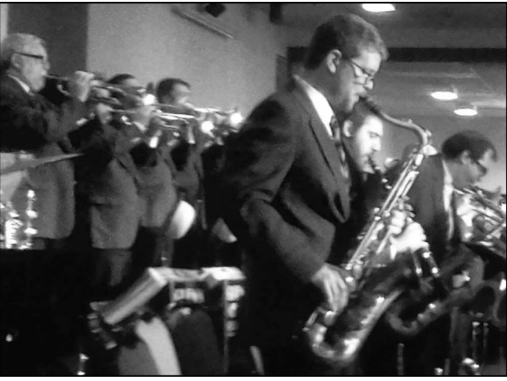
The Glenn Miller horn section performs during the March 18 concert at the FEC.