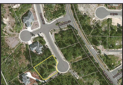
FAWN RIDGE WEST LOT Ocean view lot in area of fine custom homes in gated Fawn Ridge subdivision. All underground utilities, protective CC&Rs. Cul-de-sac location, heavily treed and filled with native vegetation. 2nd story home would enhance the excellent views $69,900 #10975 MLS#15190841