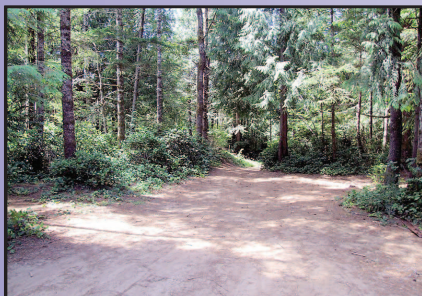
HIGHWAY 101 SOUTH Great opportunity to create a place of your dreams in front with Residential in back. Gorgeous big trees. Will require a well and septic. Contiguous parcel with Pitch & Putt property listed for sale @ $359,000. $149,900 #11100 MLS#15240611