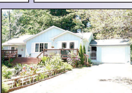
PRIVACY & PLANTS GALORE IN LAKE AREA Cute cottage with space enough to entertain on its large deck or cozy up in front of an electric fireplace after returning from a walk on the trails and beaches, which are close by. 3 & 2 with kitchen amenities of granite and tile. Sutton Lake has public access for recreation and a public boat launch. $199,900 #11127 MLS#15614079