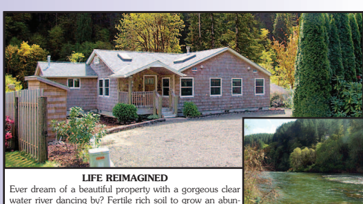
LIFE REIMAGINED Ever dream of a beautiful property with a gorgeous clear water river dancing by? Fertile rich soil to grow an abundance of fruit & vegetables? A home with character & history but brand new systems & updated with quality & care? This is a truly special Oregon dream property. Just the right size at a little over half an acre, bathed in sunshine where established fruit trees & berries thrive, rolling green grass to the water and a charming cedar sided vintage home that has been thoroughly updated for modern life. Exemplary tile work, original wood flooring & custom cabinets are a few highlights of the interior. Outside, a huge deck overlooks the gardens & river, large garage/workshop & plenty of parking with RV hook-up. Breathe in the fresh, clean air & count the stars overhead. You are home. $289,000 #11008 MLS#15439049