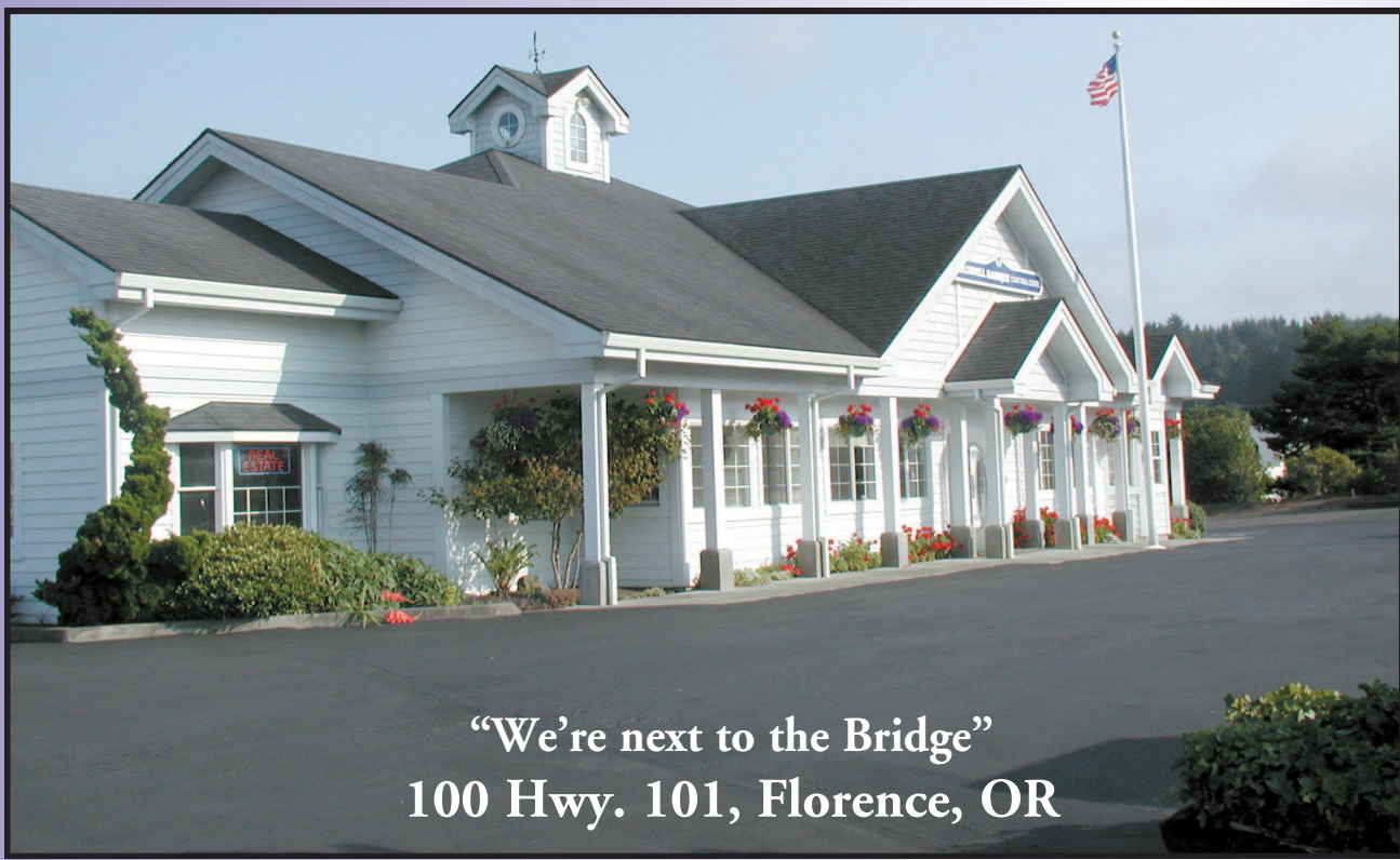
"We're next to the Bridge" 100 Hwy. 101, Florence, OR