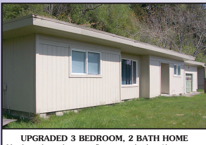
UPGRADED 3 BEDROOM, 2 BATH HOME Vinyl windows, laminate flooring in kitchen/dining area plus spacious laundry room. Master suite on one side of living room, 2 bedrooms plus bath on the other. Backyard with beautiful flowering trees - wind protected, nice for BBQ's and gardening. Kitchen appliances included. Appointment only showings. $139,000 #10816 MLS#14454820