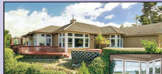
PARADISE FOUND! Private, gated Shelter Cove. Atop a quiet hilltop w/ views of the Siuslaw River & Pacific Ocean. It includes a state-of-the-art dramatic gourmet kitchen with new Alder cabinets. Fabulous great room with a wall of glass to take in the breathtaking views that are ever-changing. A stone fireplace to cozy up to after a day at the beach. $590,000 #10862 MLS#15266131