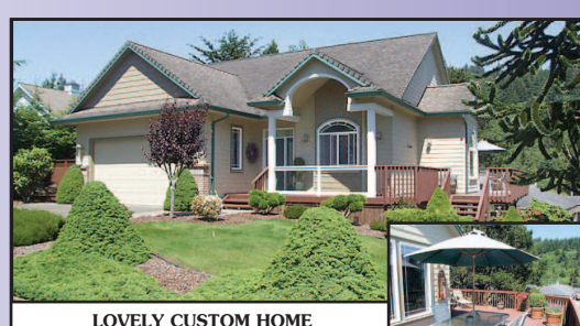
LOVELY CUSTOM HOME Ocean Dunes Golf Course home backs up to the putting green. 2510 SF, 2 separate living quarters. 4 BR 3 BA with open floor plan. Extensive use of tile, vaulted ceilings & skylights. Great room with fireplace & built in entertainment center. Dining & counter eating areas. Master suite with access to sun porch & large viewing deck. Potential for wine cellar/workshop. Great established neighborhood - all golfers welcome. $401,000 #11053 MLS#16214833