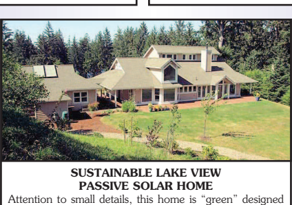
SUSTAINABLE LAKE VIEW PASSIVE SOLAR HOME Attention to small details, this home is "green" designed passive solar contemporary, solar hot water, radiant floor heat, Tuikivi soapstone fireplace/oven, Brazilian cherry & ceramic floors, Shaker style wood doors/cabinets, granite & stainless kitchen, 3100 sq ft, 4 bedroom & 3 bath. Home is wired for commercial speed internet. Nestled on 2.8 acres Woahink lake view parcel with deeded access, fenced garden. Adjacent acreage available. $698,000 #11140 MLS#15598998