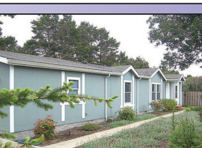
$7671 PARKSIDE DRIVE Close to North Jetty Road. Corner lot, 2003 doublewide, 3 bedrooms, 2 baths, fenced backyard, 2-car garage, vinyl double-pane windows. $192,000 #11153 MLS#15615704