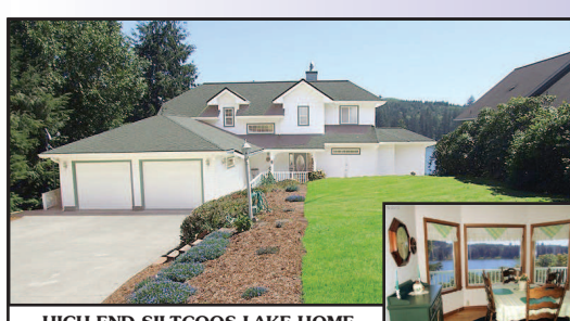
HIGH-END SILTCOOS LAKE HOME Offers: Jo Taylor Design, Carter Bros Construction & Super Good Cents efficiency! Here is lake living at its finest! Lake views can be enjoyed from almost every room. 2296 SF, 3 BR, 2.5 BA, "custom classic" with designer styling & amenities in every room. Vaulted great room w/fireplace. Gourmet kitchen, walk-in pantry. Lake view decks, boat house, licensed dock, permitted water, RV parking w/hook-ups. $695,000 #11018 MLS#15447029