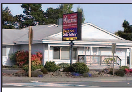
DREAM A LITTLE DREAM Make your business aspirations a reality. Prime Hwy. 101 frontage and ample parking make this commercial land and building a perfect candidate to launch your vision. Priced right for investors too. Space has been divided to enable leasing to multiple tenants. Call to find out about owner terms. $399,000 #10578 MLS#13002057