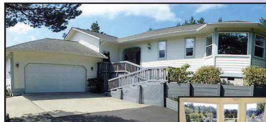
OVERLOOKING OCEAN DUNES GOLF COURSE Elegant 2972 sq ft, 3 BR, 3.5 BA home situated on private hilltop above Ocean Dunes Golf Course. Incredibly appointed with extensive cabinetry throughout, huge master suite, exciting & functional "cook's" kitchen, gas fireplace in inviting, richly accented living room with entertainment center. Take a look at the pictures & video. $449,000 #11020 MLS#15367029