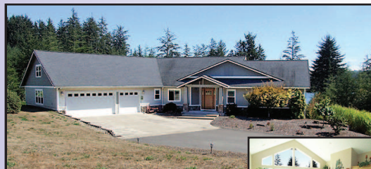
NW CRAFTSMAN - 2.88 ACRES on SILTCOOS LAKE Gated privacy welcomes you to this spectacular home featuring stunning, unobstructed views. 3000 sq ft main level with comfortable flow & easy living. 3 BR, 3.5 BA on main level. Home theatre with full bath. A spacious lower level rec room with 1/2 bath. Brazilian cherry floors, gourmet kitchen, professional appliances. Over 4600 sq ft, 2 garages with parking for 8 cars. See amenities list. $864,900 #11112 MLS#15523690