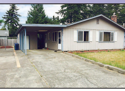
2231 19TH STREET QUAINT, WELL-CARED FOR HOME IN QUIET NEIGHBORHOOD. Wind protected city location with fenced backyard and tons of parking. Super clean 2 bedroom, 1 bath home. Move-in ready. Nice laminate flooring in master bedroom with slider to yard. Perfect starter home or retirement home. $158,000 #11051 MLS#15223023