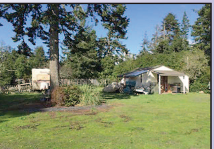
SINGING WOODS True to the name of the street, this quiet tucked away lot has it all. Water, electric, septic, shower hut and bunkhouse/storage shed. Minutes away from the beach, lakes, dunes and shopping. 5th wheel to be sold out of escrow. $69,000 #11211 MLS#16057571