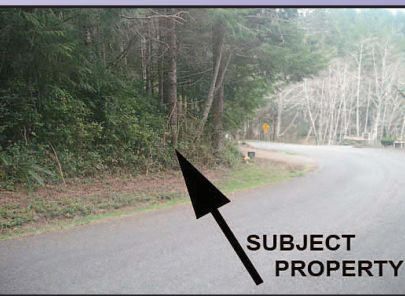
LAKE VIEW HOMESITE In area of fine homes. Nice views of Mercer Lake with deeded access!! Approved boat slip rights, septic installed. All utilities available. Elevated, wooded lot with common area lake frontage. Recent clearing of lakefront lots has vastly improved the view. $49,900 #9978 MLS#13329337