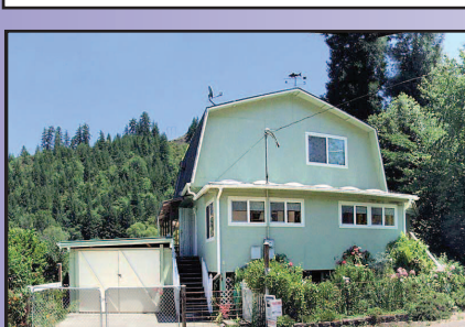
GREAT RIVERFRONT PROPERTY with registered dock, 260 ft river frontage, per owner. Wide variety of fruit trees. Peaceful retreat 40 miles from Eugene or 15 miles from Florence. $299,900 #11069 MLS#15358808