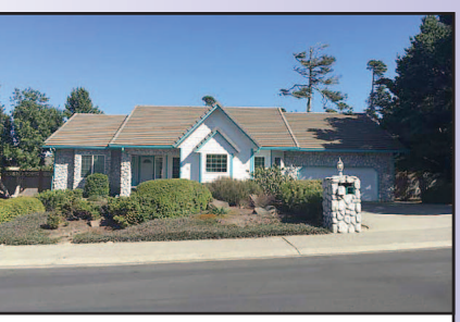
GORGEOUS 1 LEVEL HOME Gorgeous 1 level home in Shelter Cove on 0.31 acre. This 2,167 sq ft home has newer wood floors, vinyl windows and sliders, and a great enclosed deck to enjoy your landscaped back yard. Inside, it shines with skylights, ceiling fans & a delightful seascape feeling. Luxury living. $347,500 #10995 MLS#15042332