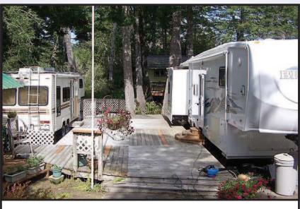
GREAT RV SETUP 2006 Bighorn 5th wheel offers comfortable living space - 1991 Aspen travel trailer used for storage/bunkhouse. The lot has Munsel Creek running thru the backside - foot bridge across leading to roomy tool shed. Large deck, upgraded electrical & gardens shed. $95,000 #11212 MLS#16165548