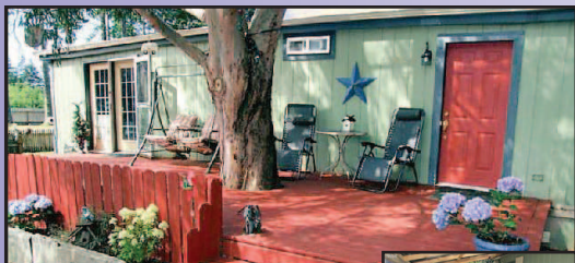
SPACIOUS & COMFORTABLE ON 3.74 ACRES HUGE BACKYARD! Mostly level, landscaped yard with trees & lovely shaded areas. Beautiful setting is currently location of "Pitch & Putt", a 9-hole golf course/recreation facility. Price is for land & improvements only. Business included at no charge. Enjoy life on the Oregon Coast with or without a nice seasonal business to run. Who could ask for anything more?! $359,000 #10880 MLS#15380379