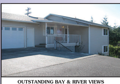
OUTSTANDING BAY & RIVER VIEWS Outstanding views from this well maintained home on a corner lot. Large kitchen, great room, dining with slider onto the south facing deck. Bedroom and bath on the upper main level. Two bedrooms, bath, family room and office on lower level with a separate entry. Half bath in the utility room. Oversized garage. Covered patio on the lower level. $290,903 #10972 MLS#15249695