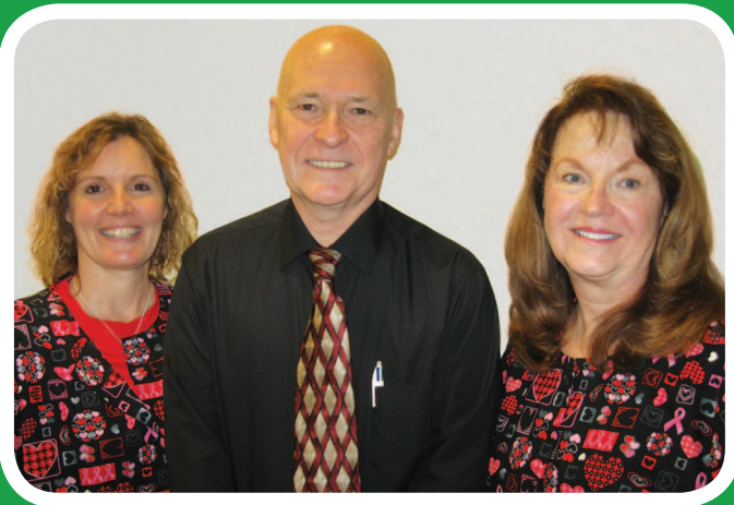
Best For Hearing Staff

Improve your life with better hearing! Call today for your FREE Hearing Consultation (541) 997-8866