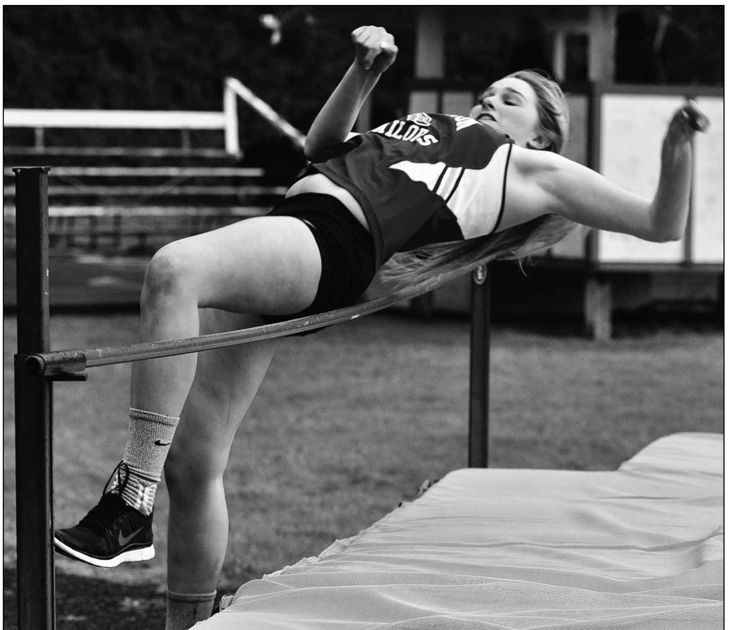
NED HICKSON/SUSLAW NEWS

2150 Hwy. 101 • Florence (541) 997-3475 • 1-800-348-3475