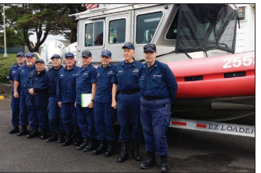
Station Siuslaw River Coast Guard Auxiliary members

member, volunteers can bring and often use past skills and talents, as well as learn new skills in areas like vessel inspections, safety checks, teaching boating safety courses and participating in boat crew operations.