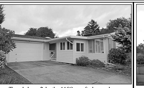
Two bdrm, 2-bath, 1100 sq. ft. home has a 1-car garage attached by breezeway and an additional bonus room with separate access. Covered sunporch with hot tub. Vaulted living room has skylights. Master suite with garden tub. $149,000 List #702/16328196