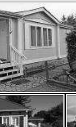
Open and spacious 3 bdrm, 2 bath MFD home. Large kitchen with formal dining space. Huge living room with pellet stove. Laundry/mud room. Great in-town location with beautiful views. $209,000 List #699/15444157