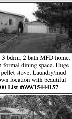
1749 Highway 101 • 541-997-1200