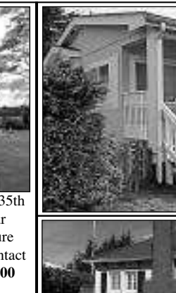
Just south of city limits sits this 2 bdrm, 2 bath, 1134 sq. ft. MFD home on 1.16 acres of property. Large master suite. Two enclosed decks one with a large hot tub and room for exercise equipment. $155,000 List #701/16570958 or fully furnished for $160,000