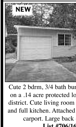
Cute 2 bdrm, 3/4 bath bungalow home located on a .14 acre protected lot near the Old Town district. Cute living room area with eating area and full kitchen. Attached 1-car garage & 1-car carport. Large back deck. $142,000 List #706/16194260