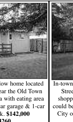
In-town level lot. Conveniently located on 35th Street, just off of Hwy 101. Located near shopping and restaurants. Existing structure could be used for storage or torn down. Contact City of Florence for approved uses. $69,900 List #695/15092122