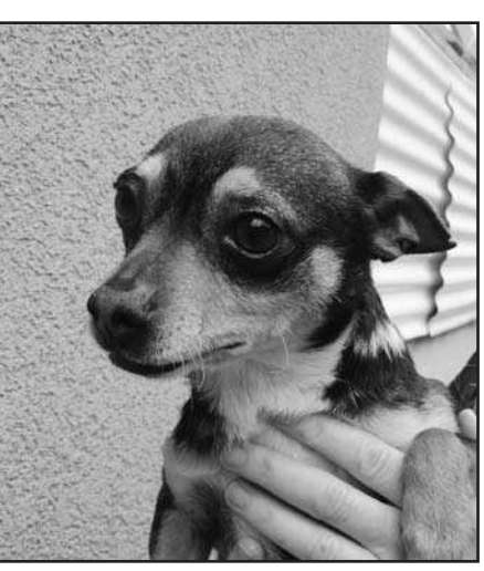
SID, No. 29988291 MALE/NEUTERED CHIHUAHUA, SHORT COAT/MIX