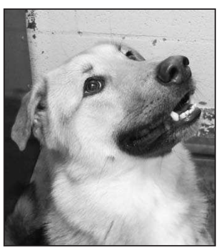
Вово, No. 22225657 MALE/NEUTERED SHEPHERD/MIX 2 1/2 YEARS OLD