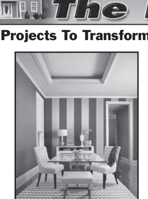
Personalize your space with