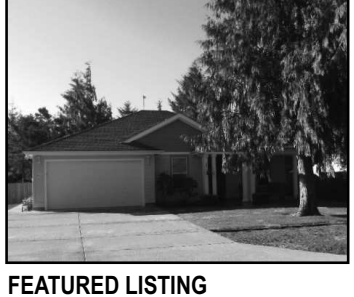
Beautiful custom home in North Lakes area. Formal living area. Kitchen opens to Family room. A must see! 3 Bdrm, 2 Ba, 1888 sq ft $334,000 BH6984 ML#15119446