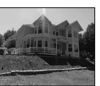
FEATURED LISTING You will enjoy River, Bridge & Old Town views from this Victorian beauty. RV parking. Boat dock. 2 Bdrm, 3 Ba, 2850 sq ft $650,000 BH7116 ML#15002330

3 Bdrm. 2 Ba. 1400 sq ft $175,000 BH7097 ML#15514369