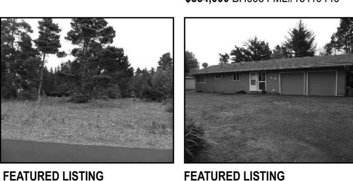
FEATURED LISTING Cute country home close to Sutton Lake. Room for RV/boat parking 2 Bdrm, 1 Ba, 960 sq ft $159,500 BH6951 ML#15348424