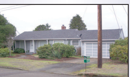
VINTAGE OLD TOWN 1950'S BUNGALOW Look at this! Oak floors, brick fireplace, fenced yard, convenient location, ductless heat pump, efficient 2 bedroom, 1 bath, oak kitchen cabinets with corian counters & newer roof. There are a few things left to do, but hurry, this one won't last! $154,500 #11150 MLS#15308345