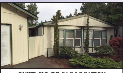
QUIET CUL DE SAC LOCATION 1991 nice, clean, manufactured home located on a quiet cul de sac: 1056 square feet, 3 bedroom, 2 bath, covered side deck, large fenced backyard, double detached garage. Home is move-in ready! Great starter or retirement property! Do plan to take a look at this property! $130,000 #11155 MLS#15294772