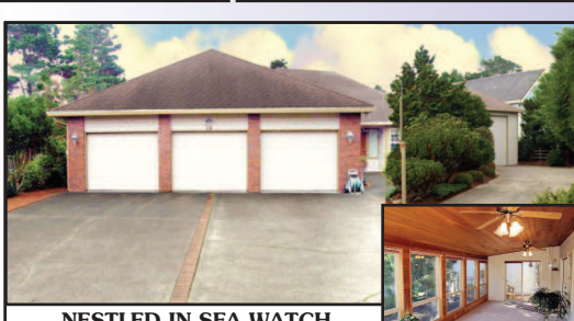
NESTLED IN SEA WATCH This home has everything on your wish list in one total package. South facing sun room off of the family room and master has a pellet stove for chilly days. Huge RV garage, 51' X 23' for those toys, plus exterior RV parking and full hook ups for visiting family and friends. 3 car garage attached. $549,000 #11145 MLS#15245723