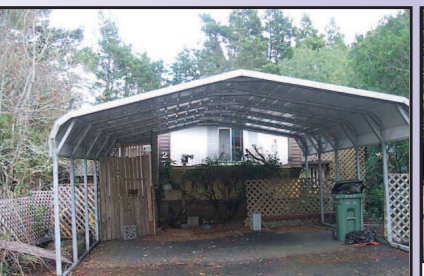
1600-27 RHODODENDRON DRIVE Value in the land. Home is older single-wide in need to TLC. $40,000 #11163 MLS#16439383