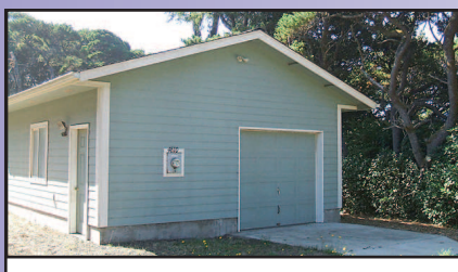
4620 JOSHUA LANE This is a rare opportunity to purchase 2 adjoining lots near the ocean. One lot has all utilities and the other has a garage with electricity. The garage currently is being used as a woodworking shop. The area surrounding these lots is wooded and adds an element of privacy. $120,000 #11159 MLS#16522065