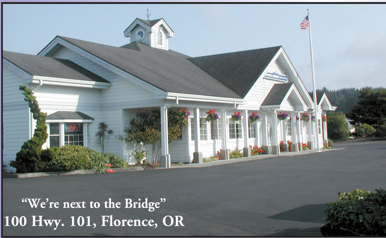
"We're next to the Bridge" 100 Hwy. 101, Florence, OR