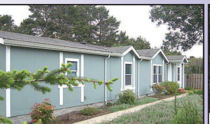
87671 PARKSIDE DRIVE Very nice doublewide close to North Jetty Road for easy access to the beach. 3 bedrooms, 2 baths, corner lot. Master bedroom separated from the other bedrooms. Great floor plan. Double garage. $192,000 #11153 MLS#15615704