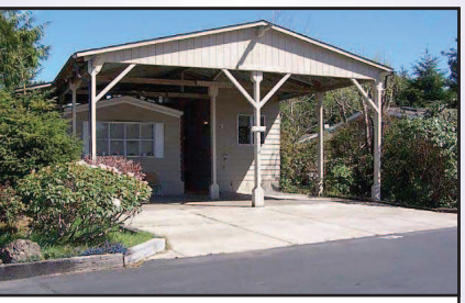
1600-136 RHODODENDRON DRIVE This home has a spacious addition and is ready for new owners! Lots of storage including tool room/storage room off living room. Carport is high for some RV's. Newer appliances. Buyer to pay $150 transfer fee at close of escrow. $114,000 #11164 MLS#16072321