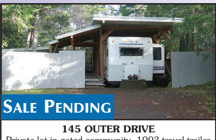
SALE PENDING 145 OUTER DRIVE Private lot in gated community. 1993 travel trailer has been well maintained. Upgraded electrical to the property. Storage shed is large and has electrical power. Partial fencing, gazebo-type structure overlooking creek at back of property. Bridge crossing the creek in place. $75,000 #11166 MLS#16550034