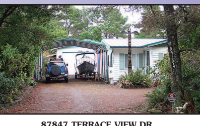
87847 TERRACE VIEW DR. Imagine a home near the beach on a fairly private .34 acre lot with RV parking & covered parking for your boat. Nicely updated with laminate floors throughout, upgraded kitchen & bathroom. Crab & fish cleaning facility, greenhouse, herb garden, chicken coop. The home also features a ductless heat pump, propane for kitchen stove & outside crab pot. This home is ideal for full time owner or weekend getaway. Call for more details! $189,900 #11154 MLS#15180017