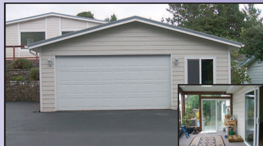
LIGHT AND AIRY Elevated home with 2 car detached garage. Lots of beautiful tiered landscaping. Home features 2 sunrooms and beautiful hardwood flooring. Interior has been painted. Amenities list attached. $225,000 #11158 MLS#16489371