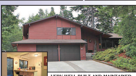
VERY WELL BUILT AND MAINTAINED Improved city home with a heated new shop on 1/2 acre. In town, yet it has the feel of being out in a rural area, with a back patio overlooking a wetlands area with lovely birds and wildlife in refuge. Contemporary custom with a retro-split level design and vaulted ceilings; very open and livable. Kitchen countertops are custom concrete. The phrase people use to describe this home is "Oh, so cool." Plus huge shop! $329,000 #11149 MLS#15271262