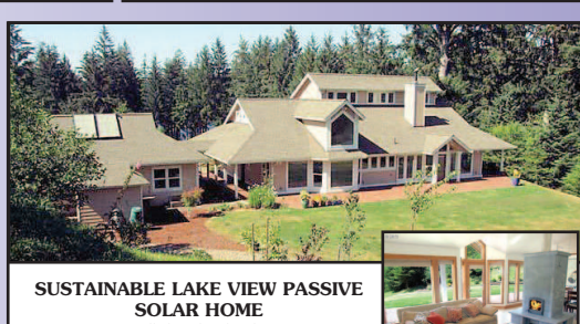
SUSTAINABLE LAKE VIEW PASSIVE SOLAR HOME Attention to small details, this home is "green" designed passive solar contemporary, solar hot water, radiant floor heat, Tulikivi soapstone fireplace/oven, Brazilian cherry & ceramic floors. Shaker style wood floors/cabinets, granite & stainless kitchen. 3100 sq ft, 4 bedroom & 3 bath. Home is wired for commercial speed internet. Nestled on 2.8 acres Washink lake view, parcel with deeded access, fenced garden. Adjacent acreage available. $698,000 #11140 MLS#15598998