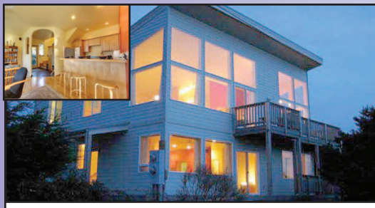
OCEANVIEW CONTEMPORARY... "GLASS HOUSE" This is a great opportunity that offers excellent flexibility income & owner use. Over 2200 square feet, 3 bedroom, 3 bath dual level home with 2 kitchens with superior quality details. Spectacular ocean view, hardwood floors & fully furnished. Continue using as a vacation rental or split with personal use or two families. No disappointments. $495,000 #11165 MLS#16327449