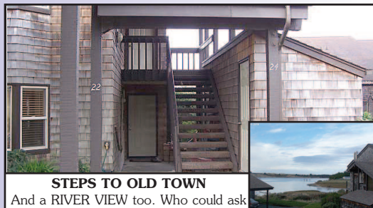
STEPS TO OLD TOWN And a RIVER VIEW too. Who could ask for anything more? Bay Bridge Condos - upper unit with view down river framed by the dunes with a deck to sit on while you enjoy the view. 2 bedrooms, 2 baths, newly painted and partially furnished. It also has a loft for the young & spry and a small storage space for your extras. $237,500 #11161 MLS#16151066