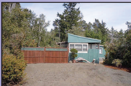
200 HUCKLEBERRY LANE Cozy travel trailer on level lot with partial fencing. Great spot to getaway from it all. Private patio area with tall front fencing. Vacations, weekends or full time living. $48,900 #11167 MLS#16039348