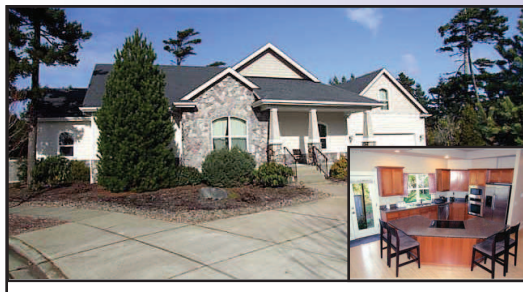
EXCELLENT LOCATION NEAR HOSPITAL Wonderful newer home near hospital. Beautifully appointed with stone accents and traditional quality. 2,246 square feet, 3 bedroom, 2.5 bath, heat pump, granite and stainless kitchen, pantry, media room, propane fireplace and central vacuum system. Must see! $305,000 #11151 MLS#15530360