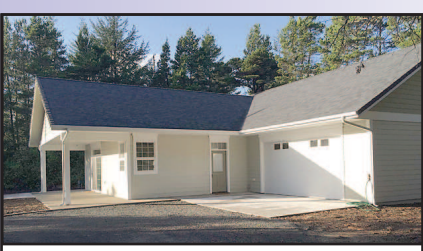
BRAND NEW CONSTRUCTION Newly constructed one level home on .43 acres wooded lot. This 1440 sq ft home has 3 bedrooms and 2 baths and an oversized 24 X 28, 2 car garage. Laminate flooring throughout living space with carpet in bedrooms and laminate tile in baths. Bathrooms are 100% marble and kitchen has solid surface counters. You'll enjoy outdoor living with plenty of covered space and your own fire pit. RV parking. $309,000 #11142 MLS#15356543