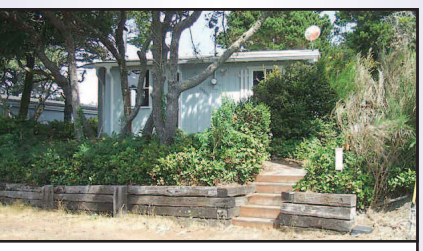
COZY BEACH CABIN This cabin needs new owners. There is a peak of the ocean from the large living room windows and the ocean is only two blocks away. There is a newer septic and some upgraded work has been done inside the home. This property was used as a rental...would be an awesome vacation rental. $144,900 #11156 MLS#16236515