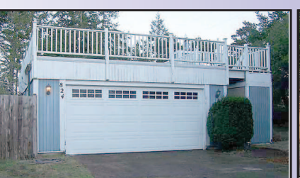
824 KINGWOOD STREET IN-TOWN LOCATION - TLC REQUIRED. Within walking distance to Old Town. Needs your attention and imagination. Corner lot - .17 acre. 3 bedroom, 2 bath home with good bones. Double car garage, roof top decks. Come see the potential! $149,000 #11152 MLS#15151047