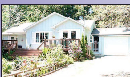
COZY COTTAGE IN SUTTON LAKE AREA Enjoy a 3 bedroom, 2 bath, single level home. Built in 2001 with granite counters, electric fireplace, large deck, and outdoor space full of a variety of plants and flowers. Greenhouse and tool shed included. Just over 1100 sq. ft. but lives larger $199,900 #11127 MLS#15614079