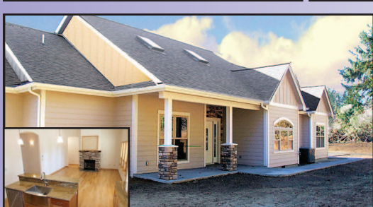
BRAND NEW CUSTOM HOME Newly completed custom 3/2 home on Sutton Lake. Over an acre of land to improve & enjoy. One level home with bamboo floors, granite counters, stainless appliances, cherry cabinets, heated tile floor in master bath, formal dining plus great room with wood burning fireplace. Southern exposed, 3-sided covered patio to enjoy entertaining & lazy days at the lake. $497,000 #11147 MLS#15405418