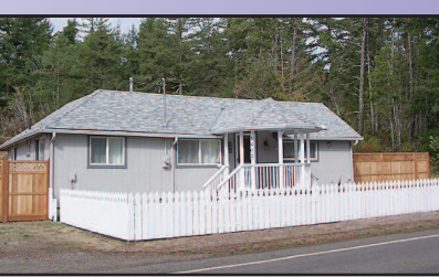
5407 NORTH FORK SIUSLAW ROAD Charming 3 bedroom, 2 bath remodeled home across from the river. Large backyard has room for RV, boat or a big shop. Newer roof, well and water system. Upgrades include gas appliances & newer double pane windows. The property corners are marked and partially fenced. Move-in ready. $164,900 #11116-MLS#15373610