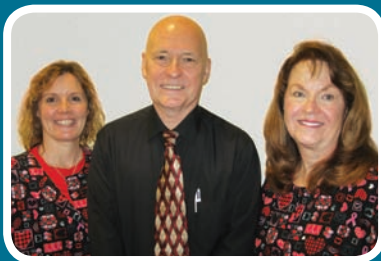
Best For Hearing Staff

*Regardless of the make, model or where you purchased it from!