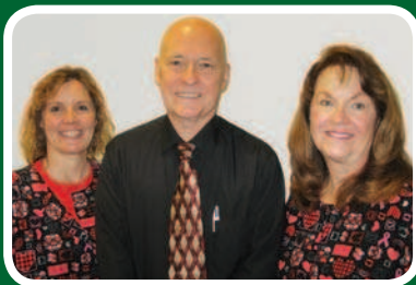
Best For Hearing Staff

*Regardless of the make, model or where you purchased it from!