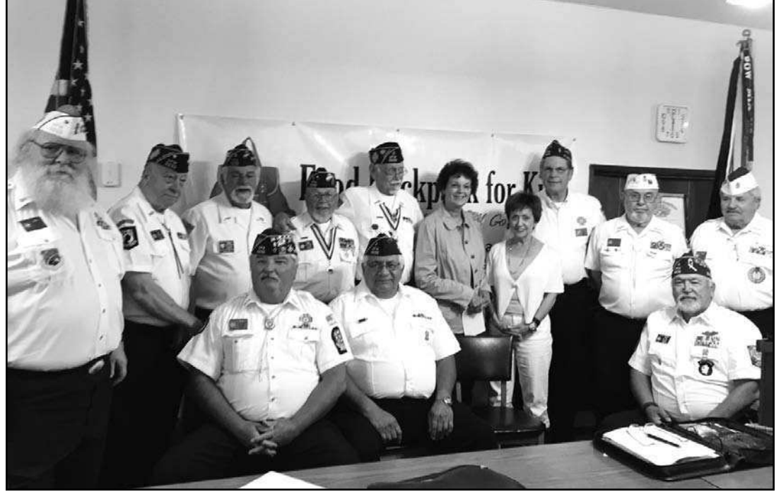
Veterans of VFW Post 3232

Florence's Veterans of Foreign Wars Post 3232 and the Band of Brothers have partnered with the Food Backpack for Kids Program by "adopting" two students for the 2015/2016 school year. With their donations, they have actually funded weekend meals for the entire year for these two students. The Food Backpack for Kids Program is beginning its fourth year providing three ready-to-eat, prepackaged, nutritious meals a day for the weekends during the school year. The filled backpacks are delivered to the Siuslaw and Mapleton school offices where they are privately distributed to the most at-risk children