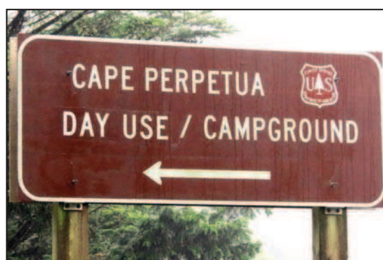
Cape Perpetua is three miles south of Yachats along Highway 101.