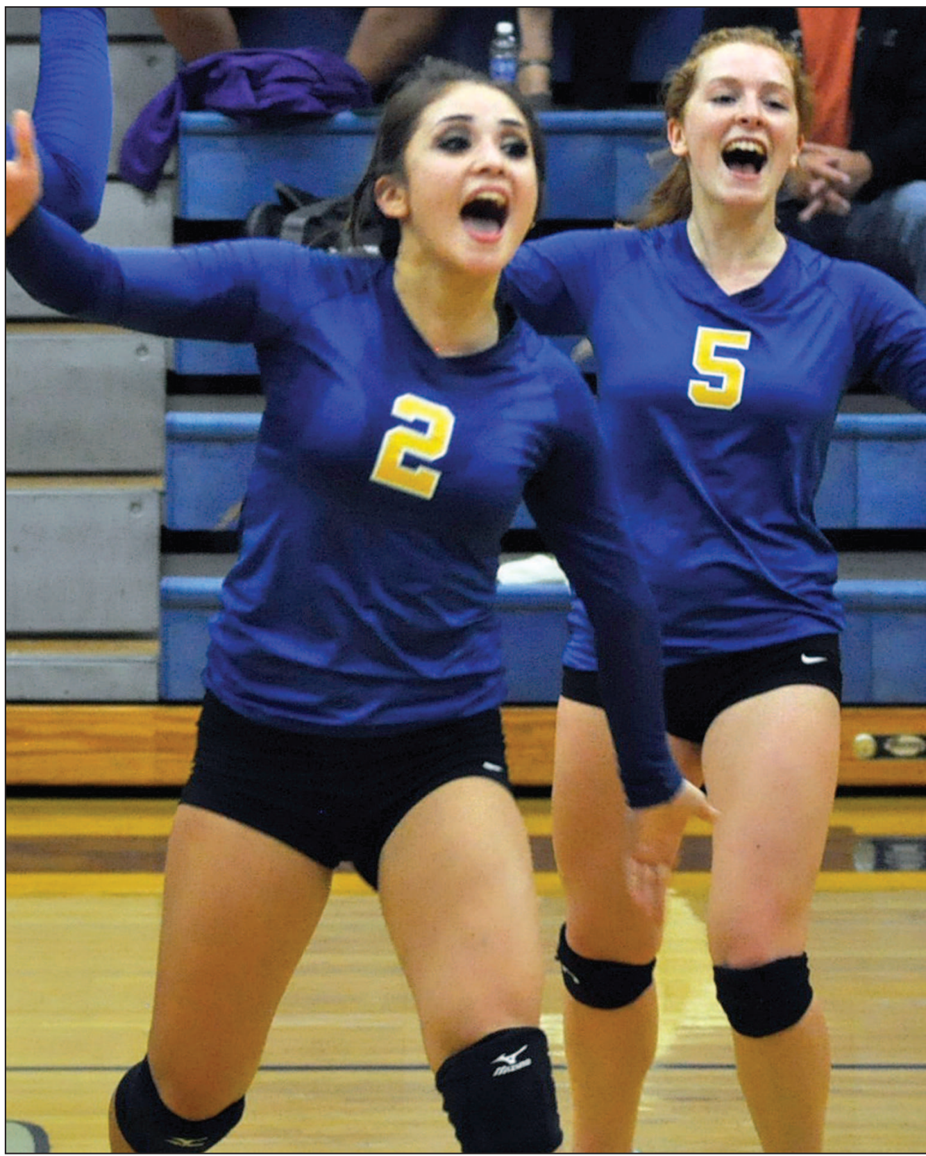
NED HICKSON/SIOUSLAW NEWS