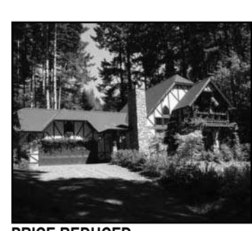
Collard lakefront lot included w/home purchase. Private Tudor Chalet, wood floors, accents, beams, arches. Massive wood fireplace, cottage 2 Bdrm, 2 Ba 1854 sq ft $474,500 BH7071 ML#15372278