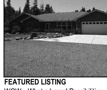
WOW...What a home! Possibilities abound w/this 6 bedroom, 4 1/2 bath home, familyroom w/door to deck. Georgeous!

6 Bdrm, 4 1/2 Ba 2850 sq ft $349,000 BH7038 ML#15250796