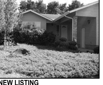
Immaculate home, private backyard w/deck. Private community Fishing/ Crabbing dock w/RV parking. Close to Beach, River, dunes & town. 2 Bdrm, 2 Ba 1472 sq ft $223,000 BH7063 ML#15464027