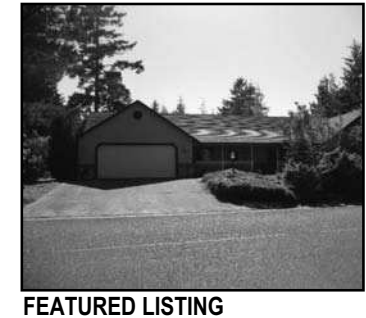
Beautiful in-town home. Spacious with cook's kitchen, living room + bonus room with slider to patio & backyard privacy for outdoor fun. 3 Bdrm, 3 Ba 2288 sq ft $359,500 BH7033 ML#15063759