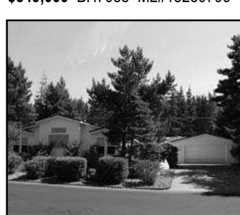
NEW LISTING Goldenwest Manor 24 x 28 dbl finished garage. 12 x 12 shop 3 Bdrm, 2 1/2 Ba 2600 sq ft $289,900 BH7078 ML#15401155