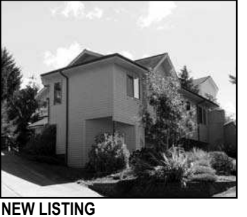
Panoramic views of Florence & Pacific Ocean. Upgraded throughout 3 Bdrm, 2 1/2 Ba 1989 sq ft $334,900 BH7087 ML#15007542