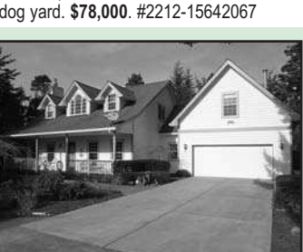
87994 Wood Lake Way N - Custom home with total privacy! 2,521 sq. ft., 3 bdrm, 2.5 bath home. Fireplace in living room; French doors in dining room open to large fenced 2-car attached