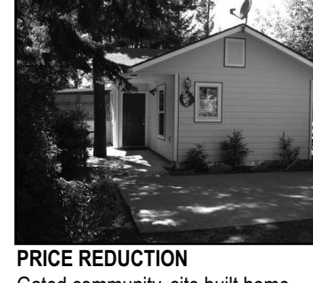
Gated community, site built home, excellent condition, Great storage, sunroom, move-in ready 1 Bdrm, 1 Ba 678 sq ft $92,500 BH6520 ML#13389737