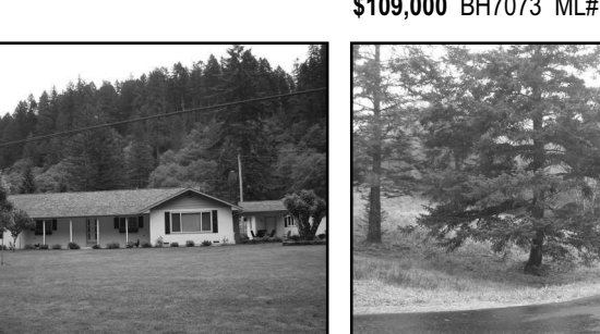
PRICE REDUCTION Siuslaw riverfront home on 5.74 acres, manicured Grounds, 3 car garage, shop, green house, garden Shed & more! 3 Bdrm, 3 Ba 2675 sq ft