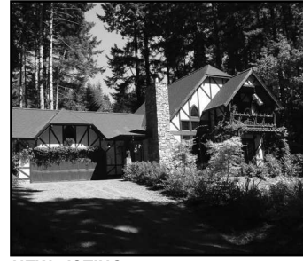
Located in the banana belt of Florence. Eurpoean style Tudor chalet on .55 acre. Solid wood accents. 2 master suites, cottage garden, deck, fountain 2 Bdrm, 2 Ba 1854 sq ft