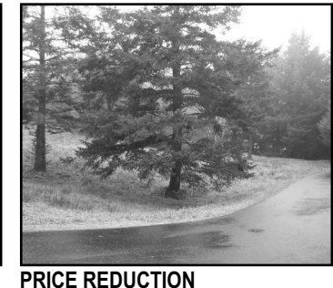
South Shore gated subdivision, 1 acre corner lot, cleared & ready to build. Septic approval, lake water available $99,950 BH6892 ML#14666443.