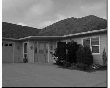
NEW LISTING Approx. 3131 sq ft golf course setting 4 Bdrm, 2 full 1 part. Ba $499,994 BH7053 ML#15664540

To create your own Market Watch report, go to www.RealEstateFlorence.com.