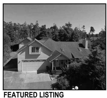
Room for big toys/close to the beach 4 Bdrm, 3 Ba 3400 sq ft $395,000 BH6624 ML#13189622