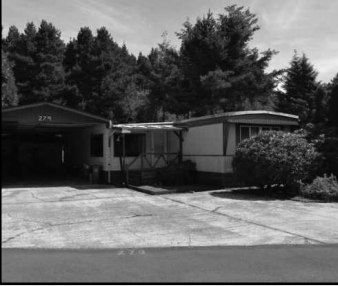
NEW LISTING 4 car carport, workshop in Greentrees 2 Bdrm, 1 Ba 924 +200 sq ft $69,000 BH7043 ML#15330400