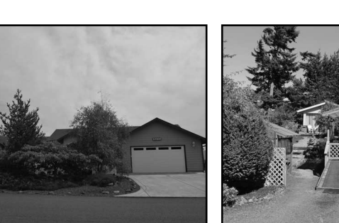
PRICE REDUCTION In Idylewood with 3 bonus rooms 3 Bdrm, 2 Ba 2920 sq ft $389,000 BH7074 ML#15545976