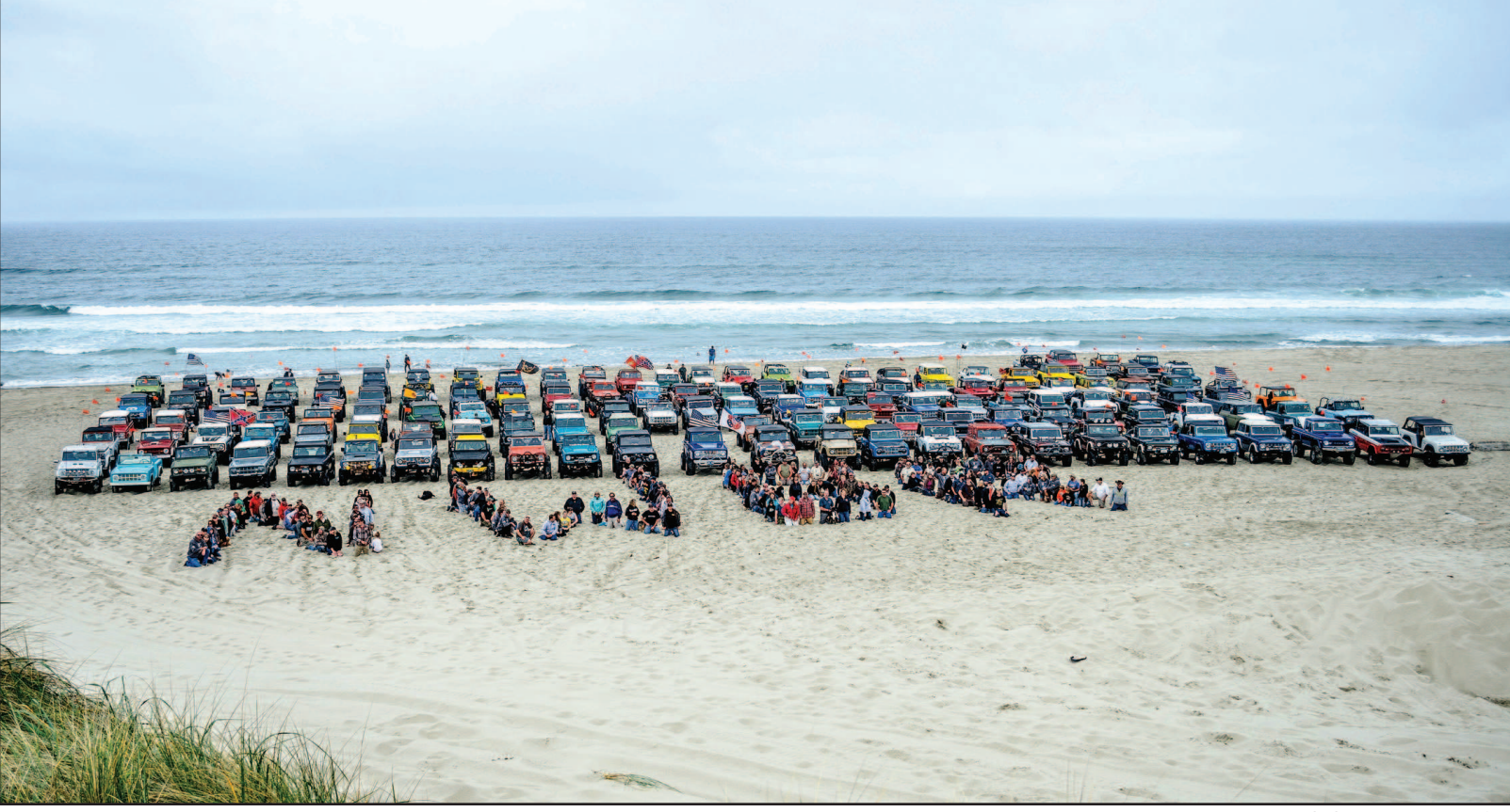
This year's Northwest Bronco Roundup participants park their 129 Broncos on the South Jetty beach near Florence. A total of 172 Broncos and more than 200 people were part of the weekend event from Aug. 15 to 16.