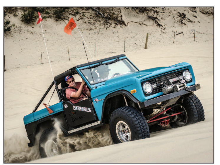
Part of the event's fun was driving the vintage Broncos in the Oregon Dunes National Recreation Area.

Organizers picked Florence because of the Oregon Dunes National Recreation Area,