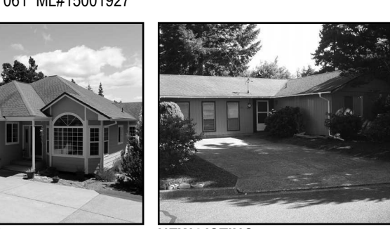
NEW LISTING Great buy, In-town. Fireplace, Covered patio, New carpet throughout, new blinds, new interior paint and bark. 3 Bdrm, 2 Ba 1498 sq ft