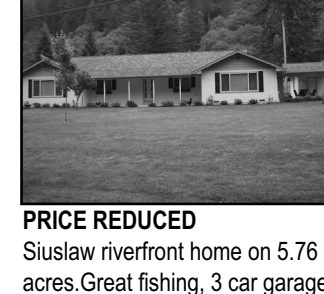
acres. Great fishing, 3 car garage, shop, barn, greenhouse & garden 3 Bdrm, 3 Ba 2675 sq ft