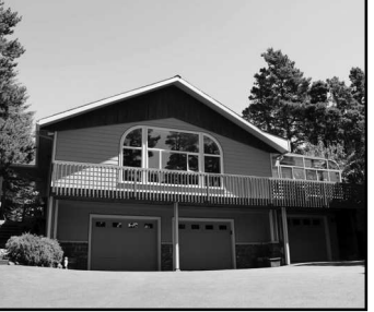
NEW LISTING Private setting bordering 40 acre county reserve. 24 x 30 double finished garage & 13 x 24 workshop 3 Bdrm, 3 Ba 3138 sq ft $525,000 BH7052 ML#15331977