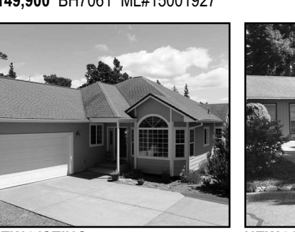
NEW LISTING Magnificent custom home with updated French country kitchen, fenced private backyard. 3 Bdrm 2 Ba 1721 sq ft $359,000 BH7049 ML#15615893