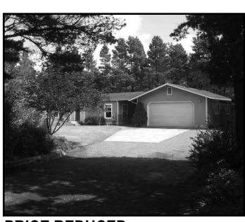
PRICE REDUCED Beach area. Secluded .7 acre with room for toys. 3 Bdrm, 2 1/2 Ba 1896 sq ft $219,900 BH6958 ML#15517528