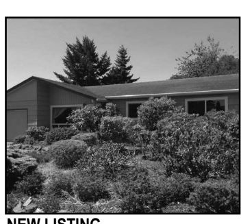
NEW LISTING Just across from the Siuslaw Public Library. This home is in great condition & move in ready. 4 Bdrm, 1 Ba 1187 sq ft $175,000 BH7058 ML#15175412