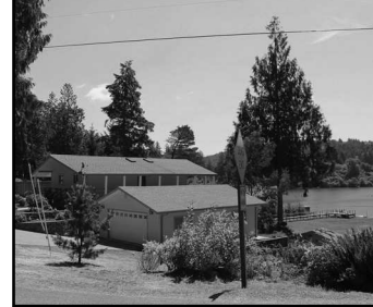
NEW LISTING Like New lake front with private dock. Pad for RV or boat parking 3 Bdrm, 2 Ba 1976 sq ft $595,000 BH7065 ML#15595532